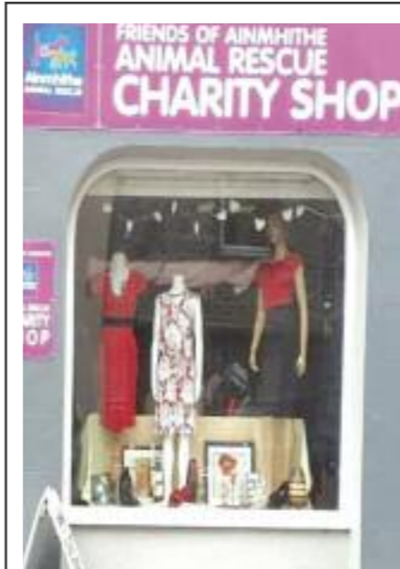
The Friends of Ainmhithe Animal Rescue Charity Shop is located on John Street, Ballina. The Shop is open 10am to 5pm Monday to Friday. Closed on Sundays.

Collection service available – call 086-3741011