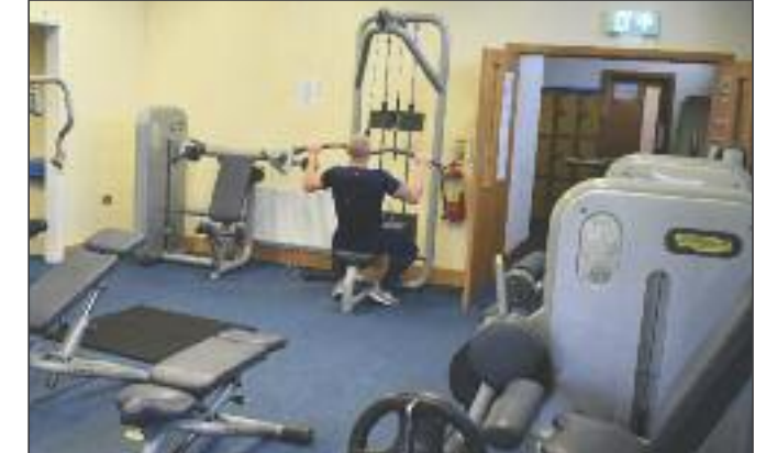
The Foxford Sports & Leisure Centre has a state-of-the-art gym with cardiovascular machines such as treadmills, rowing machines, etc.

parties and car boot sales could require assistance from all staff.