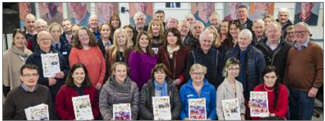
At the official launch of Mayo North East Community Journal in Ballina Men's Shed are staff and volunteers of the numerous community groups in the area.