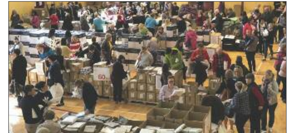
One of the many large events hosted at the Foxford Sport and Leisure centre include the annual craft fair.

Foxford Sports and Leisure Centre is a central hub for the community, centrally placed they provide easy to access, free parking and have a building that is capable of hosting large and small events. Facilities include a large sports